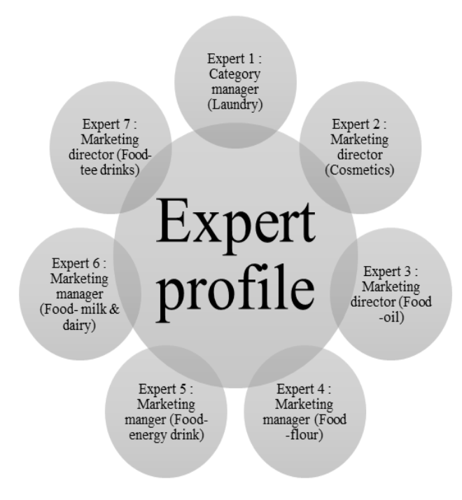
Appendix 1: Sample composition