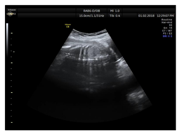
Coronal view of kidneys (showed absence of both kidneys)

Coronal view of kidneys (Color Doppler study) (showed absent bilateral renal arteries)