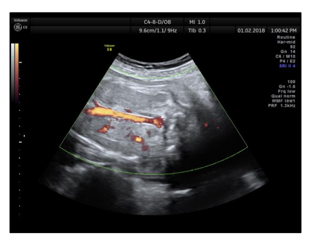
Coronal view of kidneys (Power Doppler study) (showed absent bilateral renal arteries) with absent fetal bladder