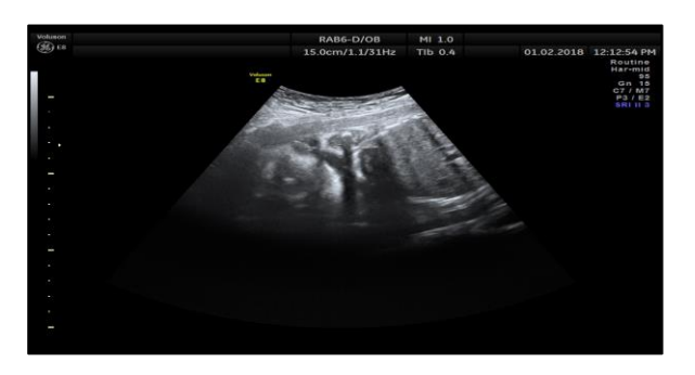
Antenatal intervention Amnioinfusion(Before) Note there is anhydramnios

Coronal view of kidneys (Color Doppler study) (showed absent bilateral renal arteries)